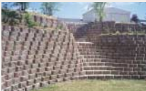
The hills and low level floodplains of Gladstone make it an ideal geographical area in need of retaining walls.

What makes the Gladstone region such a good fit with the Anchor Diamond® block? According to Malcolm Warner, Besser Masonry customer service representative, Gladstone is "the ideal spot in Australia for using retaining wall blocks. The geographical outline, with hills and low level flood plains, requires retaining wall solutions to properly develop the land." Since 1990, the Gladstone region has undergone carefully planned development, ensuring an ample supply of residential and industrial