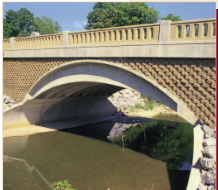
Award winning results: Function & Aesthetics