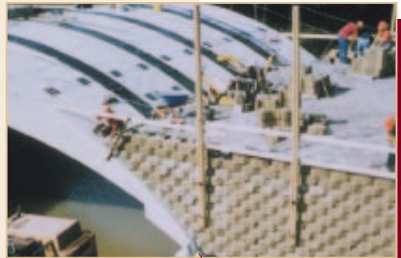
Precast arch and Keystone walls