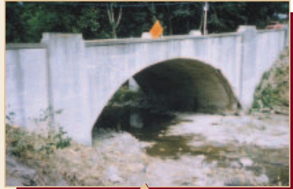
Original bridge structure

placed in a running bond pattern and connected with high strength fiberglass pins between each layer. Select, free draining backfill was placed behind the Keystone units and compacted as the units were installed one course at a time. Structural geogrids, used to reinforce the soil behind the wall, were connected over the pins and pulled taut prior to placement and compaction of backfill. This Keystone/geogrid System provides the resistance to lateral pressure from the earth fill and traffic surcharge load. The attractive concrete bridge rail system was adopted not only to provide an aesthetic solution, but also a functional crash barrier for public safety!